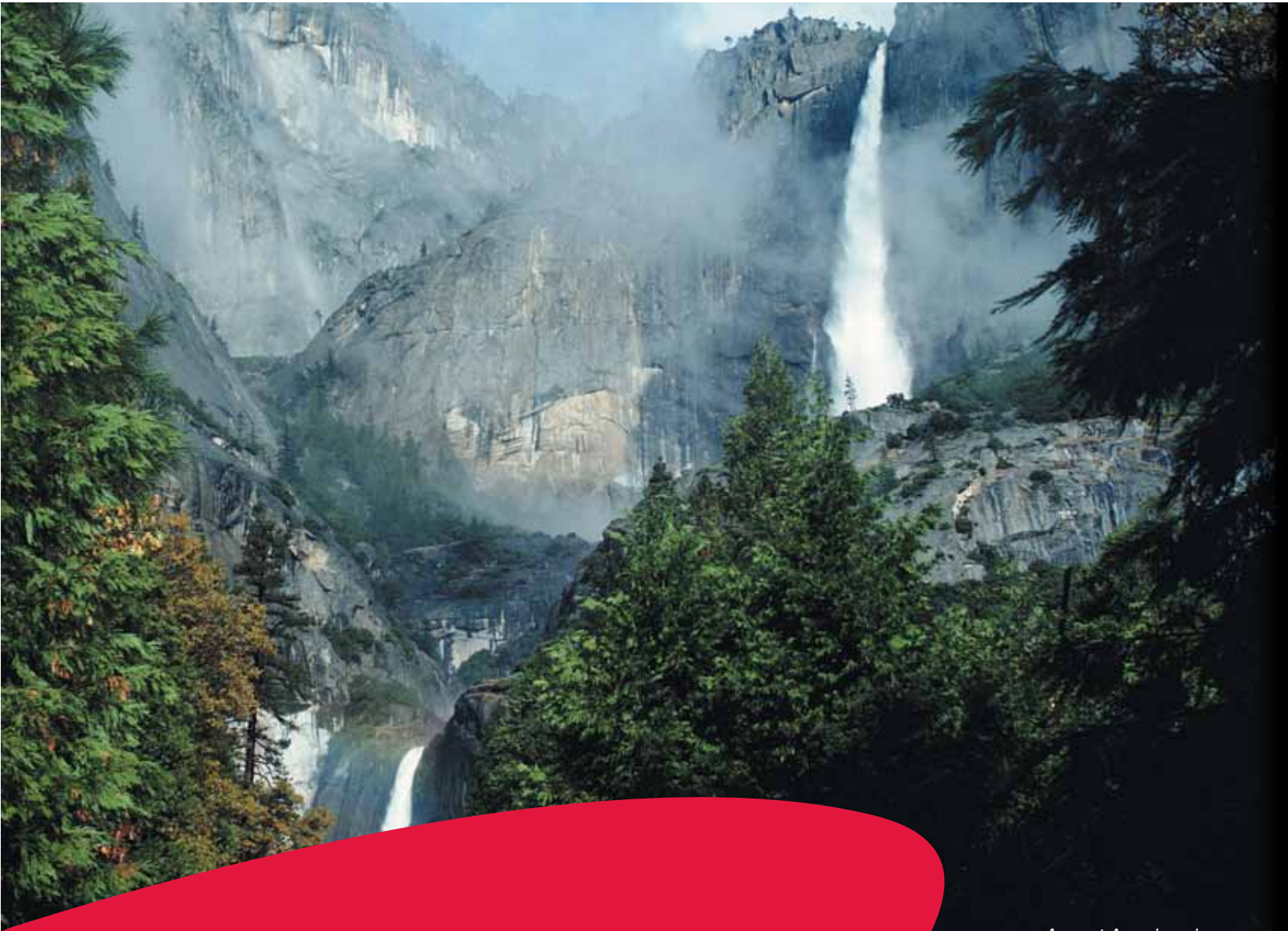
A great American icon: Yosemite Falls in Yosemite National Park, California

a guaranteed withdrawal and death benefit rider from Great American Life Insurance Company®, a subsidiary of Great American Financial Resources®, Inc.